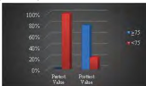
Figure 6 Knowledge learning outcomes graph

The knowledge learning outcomes of students were obtained with the test sheets of learning outcomes given before and after the treatment in the form of multiple choice questions. Individual student learning outcomes were said to be complete if students got a value of \geq 75 . This value has adjusted the minimal completeness criteria of XI grade students in Senior High School 3 Sidoarjo, which is 75. The recapitulation of knowledge learning outcomes of students from the number of 33 students was presented in Figure 6.