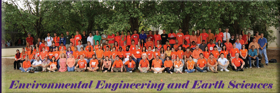
Environmental Engineering and Earth Sciences